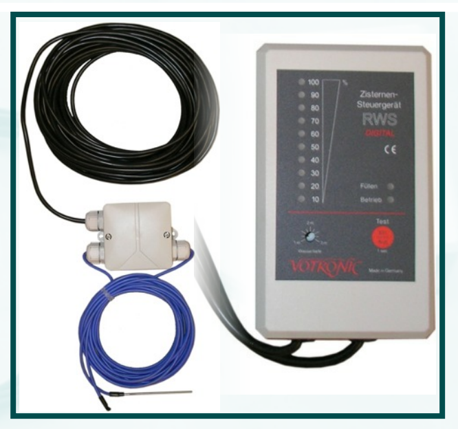
The 3P Electronic Level Gauge Product code 5000500CG

The gauge in and near the rainwater tank operates at a safe low voltage of 12V DC.