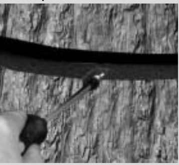
Use the small screw provided to secure the lid in position.