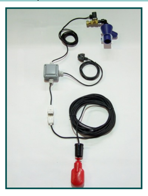
The 3P Rainwater Top-up Switch without Pump Control

A range of suitable stainless steel submersible pumps are available from your supplier. Pump bases for bottom mounted pump intakes are also available from stock.