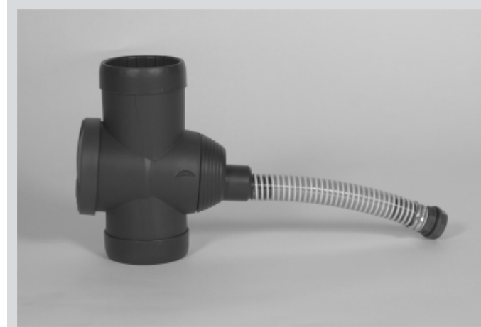
Filter Collector Universal: Art. No: 2000840U